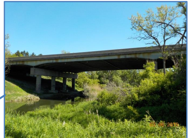
Ganaraska River Bridge