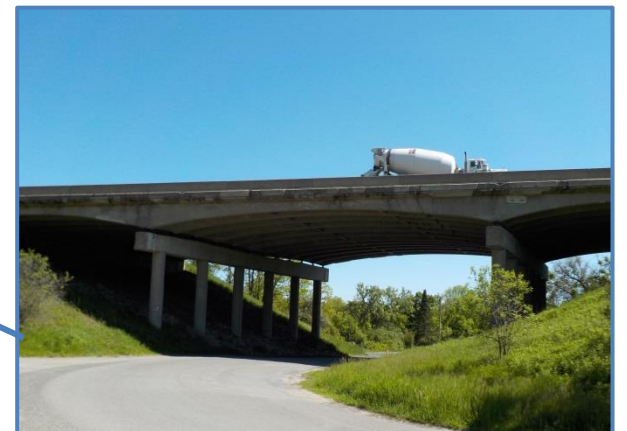
Choate Road Overpass